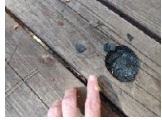
Ember Char on deck. Returning evacuees were thankful that pine needes were recently removed and that their deck was clear of anytning flammable.

As one example of the danger of embers to homes, evacuees returned to a home near Sierra Springs, a half mile or so from the Caldor perimeter, to find the forest and neighborhood seemingly unaffected - until finding a dozen charred holes on their deck where embers had fallen.