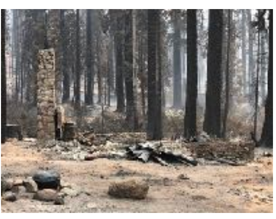
August 29, 2021